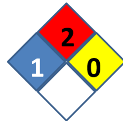
NFPA (National Fire Protection Association)

Information contained in this publication or as otherwise supplied to Users is believed to be accurate and is given in good faith, but it is for the Users to satisfy themselves of the suitability of the product for their own particular purpose. Nease Co. LLC gives no warranty as to the fitness of the product for any particular purpose and any implied warranty or condition (statutory or otherwise) is excluded except to the extent that exclusion is prevented by law. Nease Co. LLC accepts no liability for loss or damage (other than that arising from death or personal injury caused by defective product, if proved), resulting from reliance on this information. Freedom under Patents, Copyright and Designs cannot be assumed.